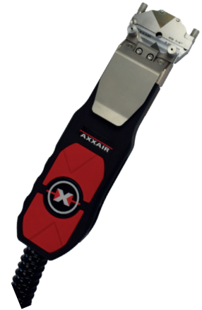
X-500 with cassette

The X-500 covers the size range of 3 - 12.7 mm (0.118" - 0.500") OD using diameter specific clamping cassettes. Air-cooled and water-cooled versions are available.